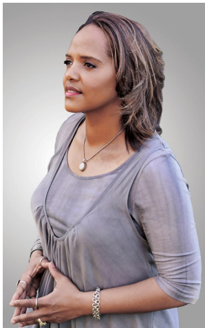
Terri Lyne Carrington

We are excited to announce that NEA Jazz Master Award winner and distinguished composer, musician, producer, educator, and GRAMMY award winning jazz artist, Terri Lyne Carrington, is joining our IAWM Advisory Board. In addition, IAWM will also partner with the Jazz and Gender Justice Institute at the Berklee College of Music where Carrington is both the founder of and serves as Artistic Director. The mission of Jazz and Gender Justice Institute is to recruit, teach, mentor, and advocate for young musicians seeking