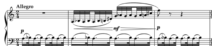
Ex. 5. Movement 2. “Green”