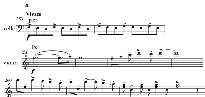
Ex. 7. Movement 4. “Dancing Colors”