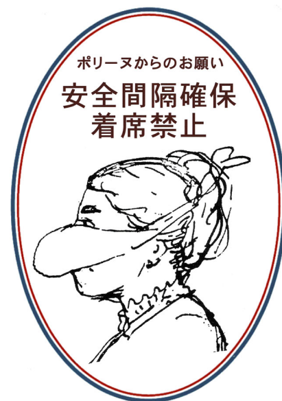
Pauline Viardot-García, self-portrait (Pauline Viardot in Baden-Baden und Karlsruhe, Nomos Verlagsgesellschaft, 1999)

A Pauline Viardot-García 200th birthday anniversary concert was held on July 18, her exact birthdate, at Oji Hall in Tokyo. Several songs and piano pieces, including the song Sérénade and its piano arrangement, were superbly performed by