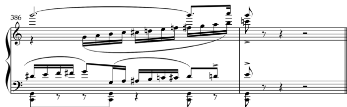
Ex. 8. Conclusion