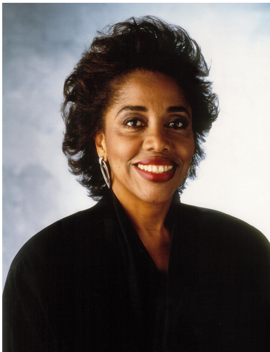
Tania León Pulitzer Prize Winner

INTERNATIONAL ALLIANCE FOR WOMEN IN MUSIC