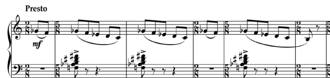
Ex. 3. Blue in diminution

I have known the members of the Cassatt Quartet for many years. The ensemble performed on my new-music series, Cutting Edge Concerts, on several occasions and recorded my first string quartet, Dreams of Flying . I