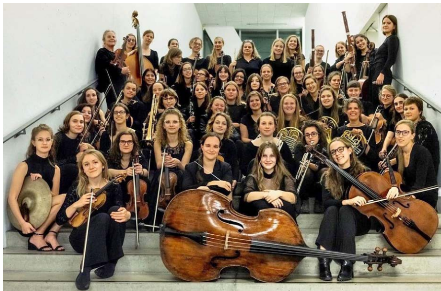
Virago Symphonic Orchestra

I applied for a subsidy from the Flemish Government but received a negative answer. I then organized an auction with a positive result. I contacted numerous companies by mail and by phone; I always asked for a personal interview so they could see and hear how passionate I was about this project. But the answer was negative at least 98% of the time, with the same message: We are not supporting women's rights