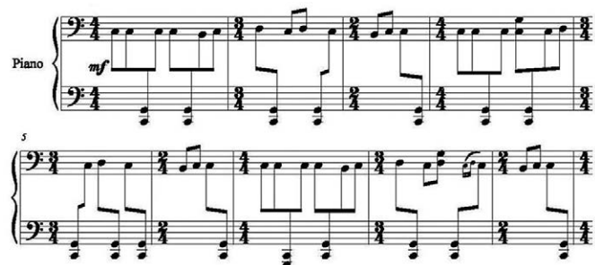
Ex. 1. Six Pictures for Piano

A major inspiration for me has been the music of Komitas (1869-1935), an Armenian priest, composer, ethnomusicologist, singer, and choirmaster who is considered the founder of the Armenian national school of music. Komitas was one of the first Armenian musicians to obtain professional training in Western classical music,