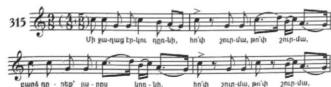
Ex. 2. Hop Shurma , an Armenian folk dance song